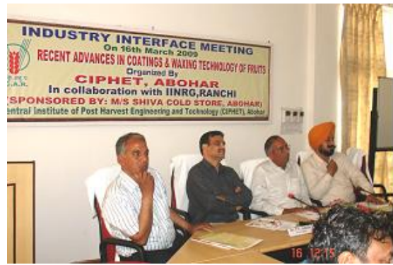
Technical session during Industry interface meeting