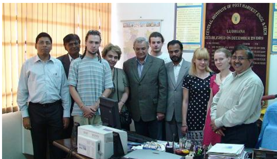
Russian delegation visiting CIPHET on March 4, 2009

A group of students of agricultural engineering discipline along with one faculty member visiting PAU Ludhiana, visited CIPHET Ludhiana on March 4, 2009. They were explained institute activities and shown the facilities of laboratories and pilot plants.