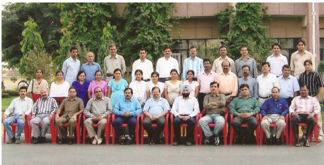
Participants of winter school on utilization of crop residues for production of enzymes and bio-fuels