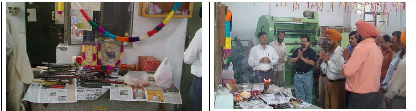
Vishwakarma Puja at CIPHET Ludhiana

In Punjab, Vishwakarma puja is celebrated on next day of Dipawali to worship the tools and machines used for fabrication of prototypes and equipment for research. Institute also celebrated Vishwakarma puja on 11 th November 2007 and worshiped the tools and machinery. A get together of institute staff was held to mark the occasion.