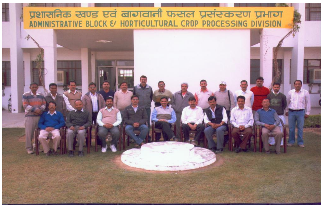
Participants from Uttarakhand for training programme on Post Harvest Management and Value Addition of Horticultural Produce