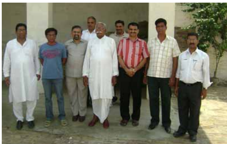
Progressive farmers of Ramsara village with Director CIPHET