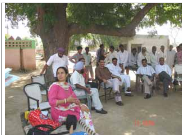
ARS Probationers and others are at village seminar including NAARM faculty