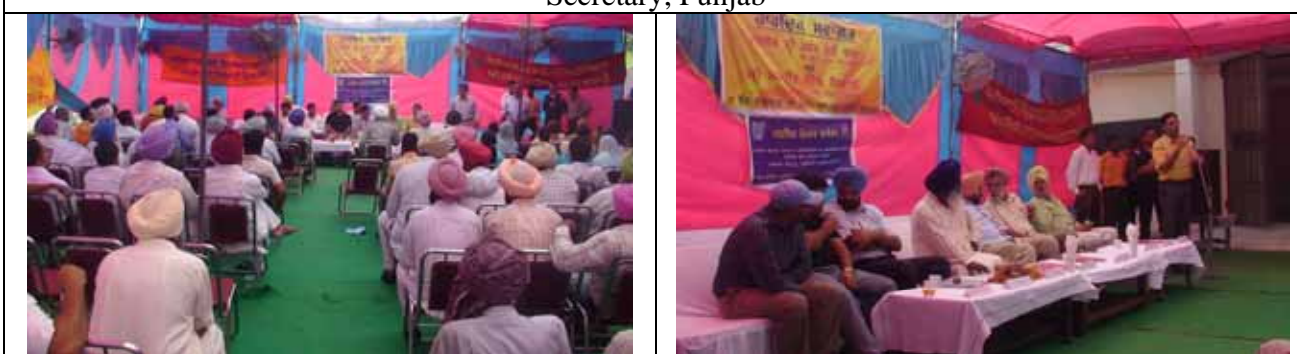
Entrepreneurship development cum awareness programme by CIPHET at village Barnhara near Ludhiana