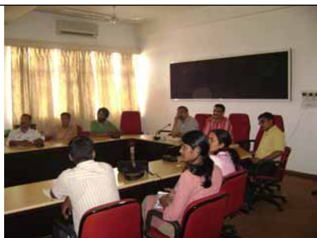
Presentations by ARS Probationers at CIPHET Abohar on Sept. 15, 2008