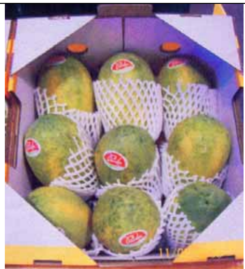
Papaya packaging in CFB for Export