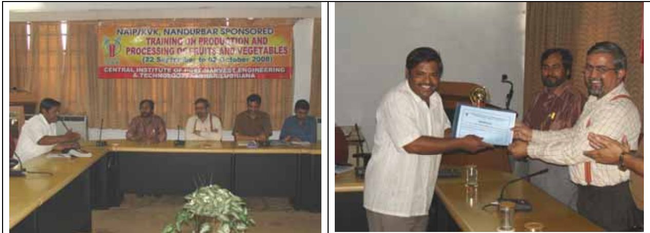
Valedictory function of NAIP/KVK sponsored training on Oct 2, 2008