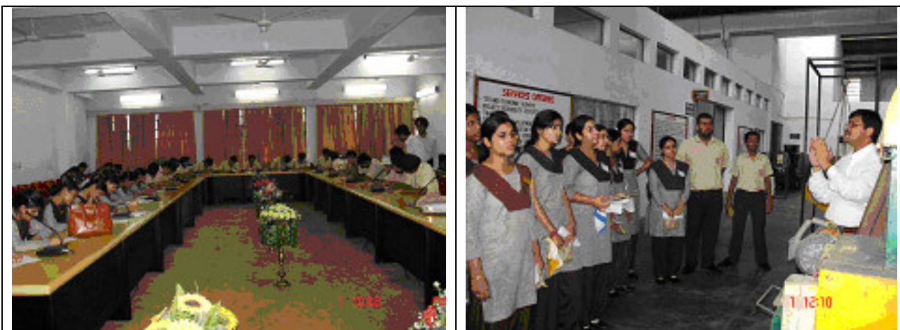
The students writing the nutrition quiz and being explained about CIPHET research activities