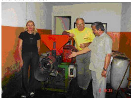
Director CIPHET visiting virgin cold pressed sunflower oil expression unit in Serbia