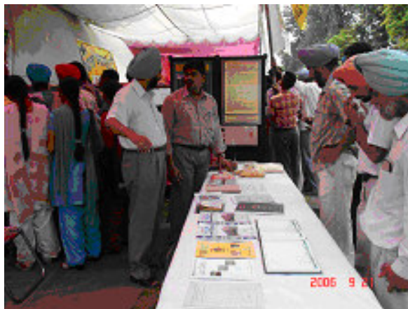
Farmers visiting CIPHET Stall

The institute participated in Kisan Mela on September 20 – 21, 2006. The Kisan Mela was organized by Punjab Agricultural University, Ludhiana. Mobile agro processing unit, posters on technologies developed by the institute, products (high protein high fibre biscuits, ground spices, besan, dal, guava bars etc.) and institute publications were displayed. The farmers look keen interest in mobile agro-processing unit. Few entrepreneurs also visited us and expressed their keen interest in fruit bars, porous bricks and training for soy-milk processing. The participation in the mela was very successful and is expected to spread awareness about CIPHET.