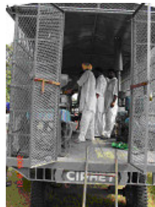
CIPHET Mobile Agro Processing Centre